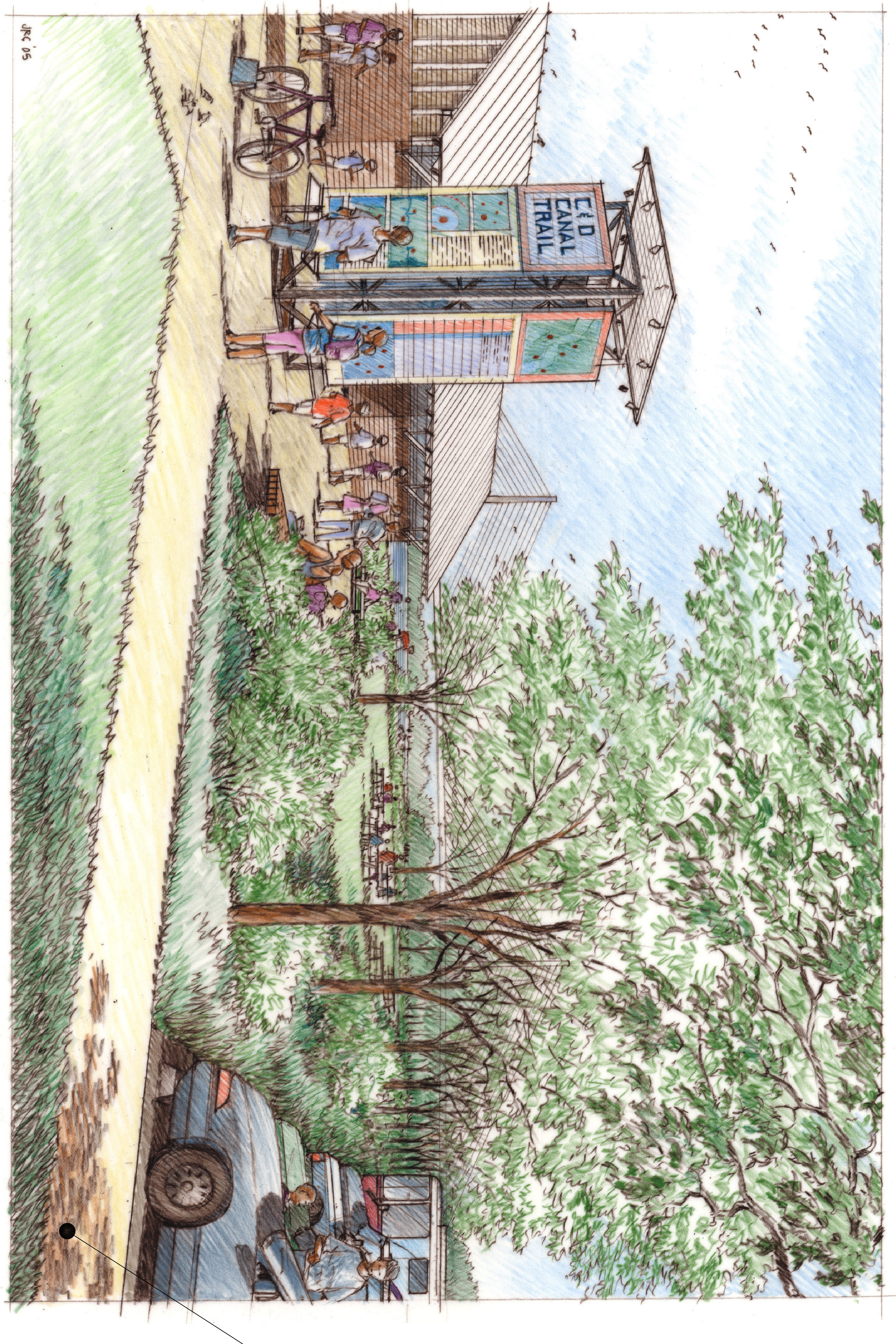
PERSPECTIVE 2 - LOOKING WEST @ SR 1 BRIDGE