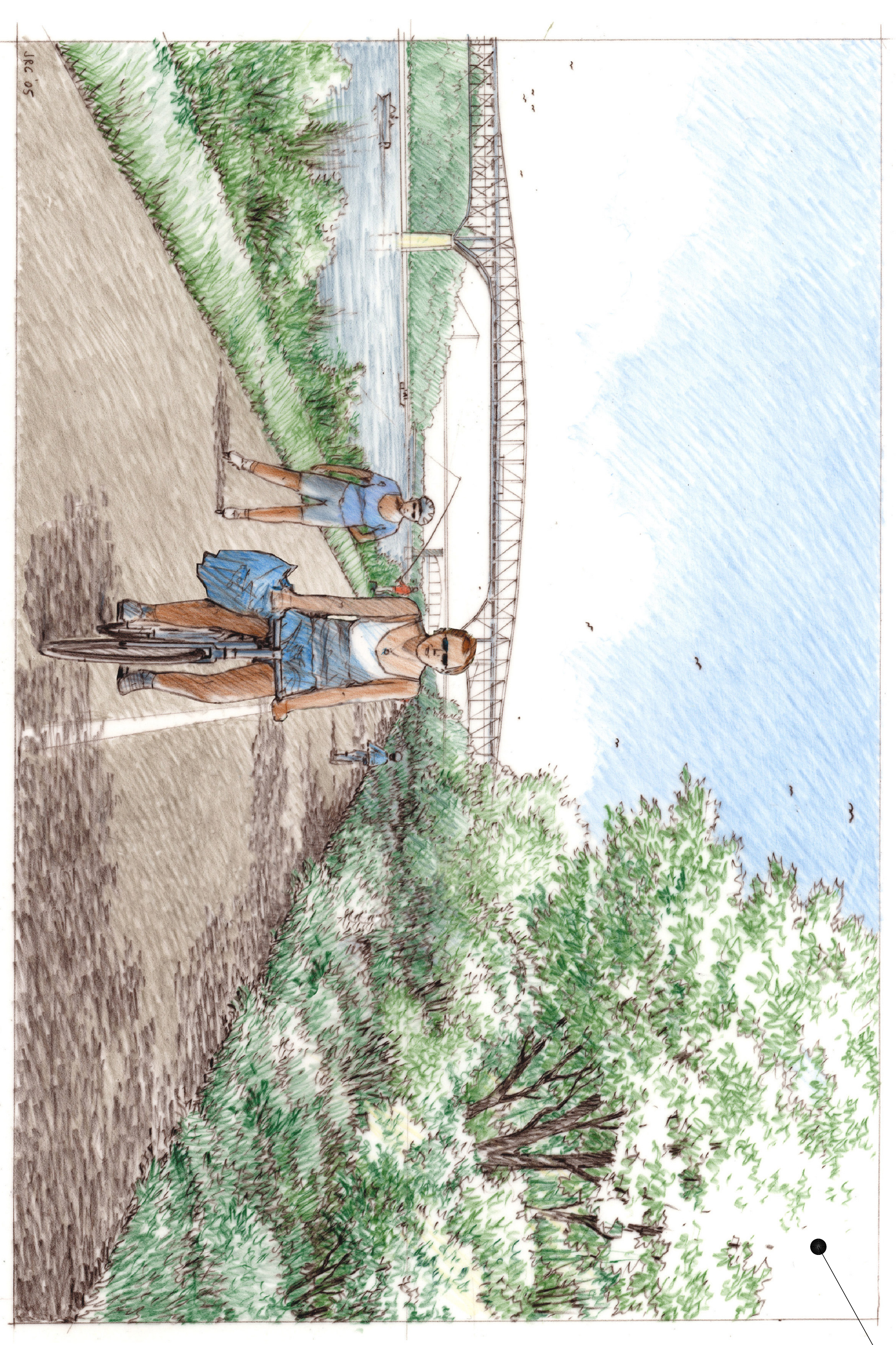
PERSPECTIVE 1 - LOOKING EAST @ SUMMIT BRIDGE